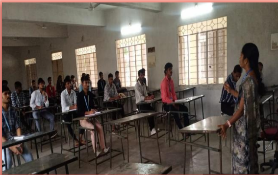
Group Discussion Tips for Tier 2 student

The 15 th day of the Placement Training Programme for final-year students focused on the Mongo DB . A total of 53 students participated in the session.