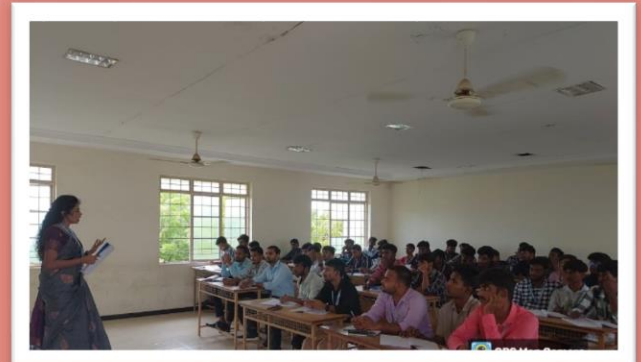
Aptitude class for Tier 2 students